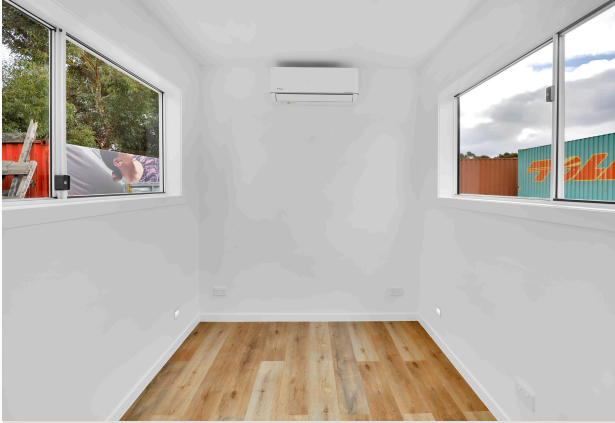
Paint - Internal