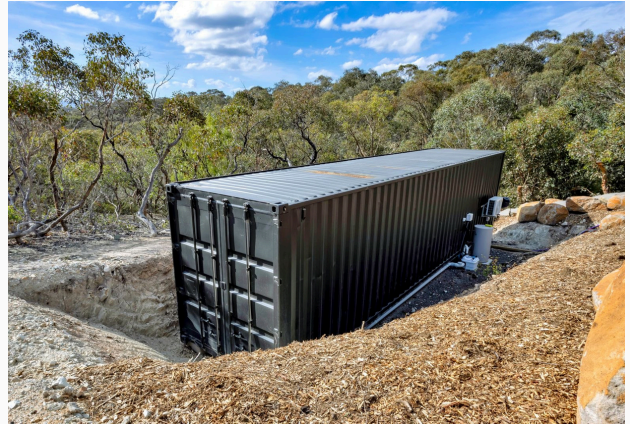
Paint - External