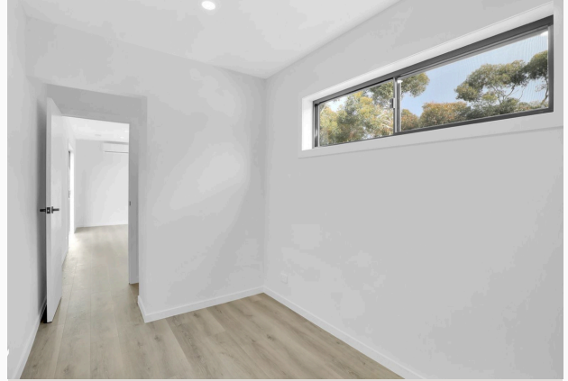
Paint - Internal