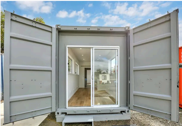
Paint - External